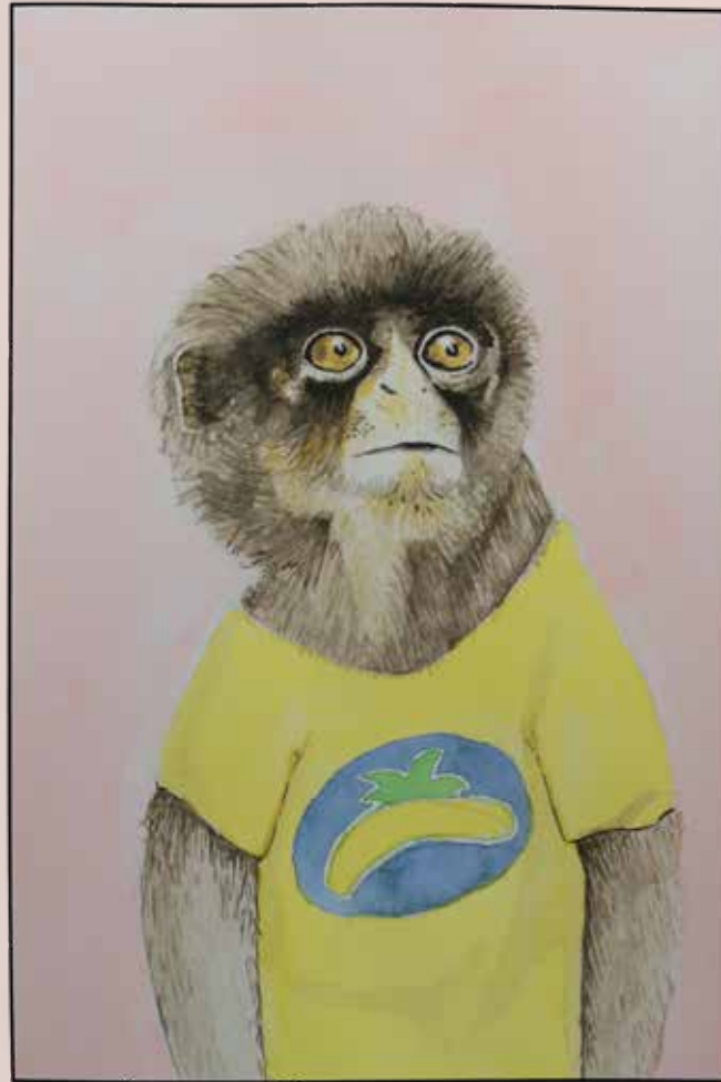
Rashid Raffles footprint and info:

Take care and keep on climbing up and beyond!