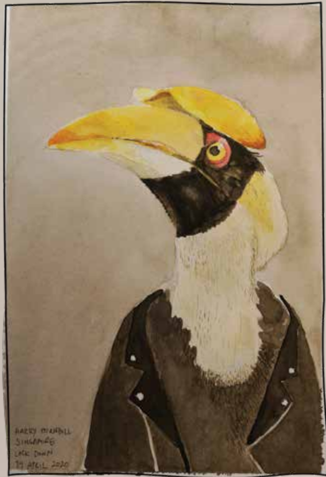
Harry Hornbill footprint and info:

Sooner than we think, they'll let us fly again!