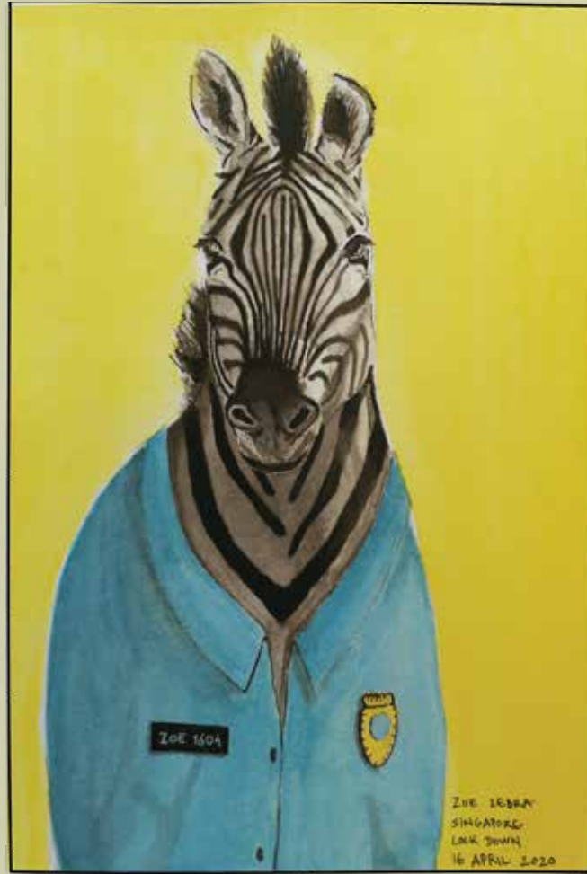
Zoe Zebra footprint and info:

Stay save and informed! We'll be trotting out of this one soon!