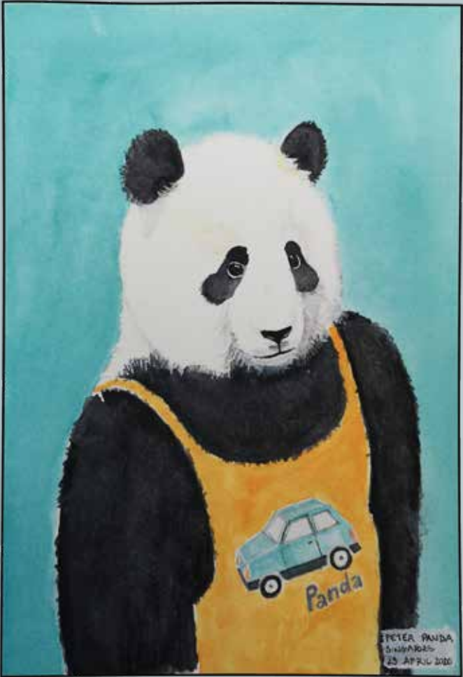
Peter Panda footprint and info: