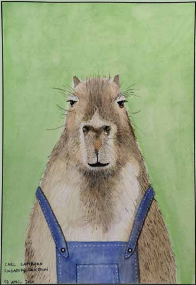
Carl Capybara footprint and info:

Meanwhile, take care and wash regularly!